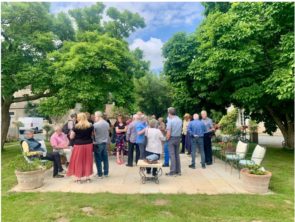
The congregation after Morning Worship in Vouvant, being treated to coffee at the Cattells' Château de la Recepte on Sunday 15th June.