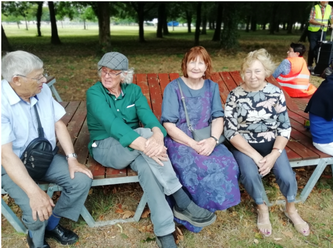
A rest during the Ecumenical walk in Fontenay-le-Comte, 6th July